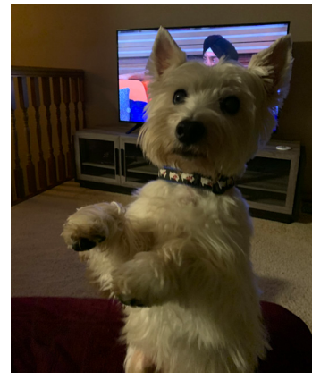
YANCY - AGE 11