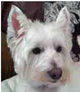
Sparkle (In Care)

He would love someone who would like a lap dog.