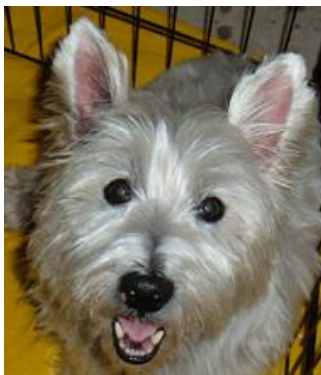
Max (In Care)

After a stay in foster care, he found a wonderful forever home.