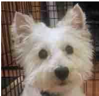
Cassie (In Care)