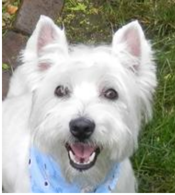
Jacky (Fostered 90 days)

Jacky, age 4, arrived in Westie Rescue because his owners lost their home. They gave him away to some kids who took him home to Mom....Mom said, "No, I can hardly afford to feed you much less a dog." After a week or so, she won and he was surrendered to us. His skin was irritated from fleas. He had an infection which was treated. He goes nicely into his crate at night for sleeping and likes lots of attention and petting.