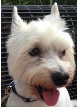
Deacon (In Care)

After testing, it was found that Max was sick due to the consumption of a tainted treat and over time and he recovered fairly quickly. He picked his own forever home when he took to a visitor to the home and he made it clear this was his new mom!