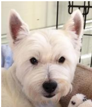
Robbie (In Care)