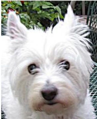
Dee Dee (Fostered 21 days)

DeeDee, age 3, came into foster care when her owner felt unable to care for her properly. The owner was disabled and had not successfully trained her as a puppy. So at full size, she became more than the owner could handle. The owner felt frustrated and a bond had not formed between the pair.