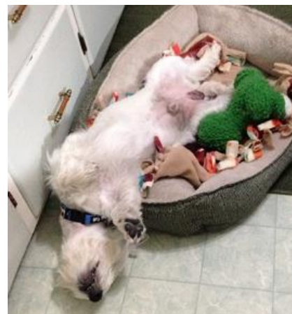
Foster dog Robbie says “It was an exhausting year! Please help foster!!!”