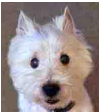
Kelly (In Care)

Bridget was adopted in 2012 through Westie Rescue Michigan. Her new parents both passed away and Bridget needed a new home. The family had arranged a new home which we were able to approve easily. Bridget was able to go to a home where she knew the adopters and they already loved her. If you adopt a dog through us, we recommend you make arrangements for someone to adopt your dog in the case of your passing. We will simply ask them to apply and be approved in the same manner you did. If they pass our normal requirements, they will be able to adopt quickly and your dog won't have the additional stress of multiple moves.