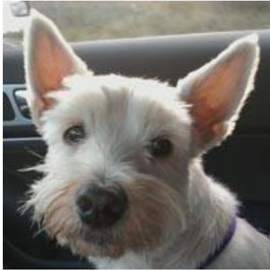
Digger In Care

Digger , age 8, is a neutered male who was originally adopted out of a shelter. The new owner had no idea why he was surrendered or if he was a stray. Unfortunately, his owner recently had surgery and could not hold the leash to control him anymore. Digger was up to date on his vaccinations and is not a biter or aggressive. He's just a handful and needs a terrier person. He is a "talker" and his deep voice sometimes puts people off. Digger is healthy but he did lose about 5 teeth in his dental.