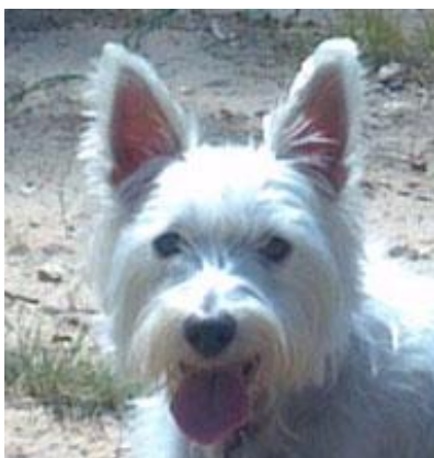
Dallas In Care

Dallas , age 5, was surrendered to a Canadian Westie Rescue group because the owner was allergic to him. The Canadian Rescue was full so we agreed to take him.