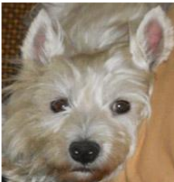
Princess Fiona of Lachlyn Fostered 34 days

Princess Fiona of Lachlyn (now Bon Bon) , approx age 6 -7, was a stray. She was hanging around the neighborhood for about a month before someone took her to the local shelter. They kept her for a few weeks and then called us to see if we would take her. They had been calling her "Rags".