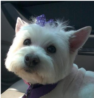
Maggie Fostered 90 days

Maggie (now Maggie Mae) , approx. age 8-9, was surrendered by a family who said they found her 4 years ago on a website and drove to Indiana to "save" her. The woman who had her there indicated that she had rescued Maggie from a puppy mill. When they got her, Maggie was a mess and it took about a year to get her white coat back. To add to this situation, about 3 weeks after her original adoption they found out that she was pregnant and maybe 5 years old. After the puppies, she was spayed. Maggie was very scared and timid when they got her so when they had company over or during storms, they started putting her in her crate in their room so she wouldn't be so anxious during these times. Then they had a child. The boy is 2 years old now and Maggie wasn't doing well with him at all. (So many Westies come in when the child reaches toddler age.) Maggie did very well with the adults and other dogs in the foster home but she is very shy. She has been adopted and continues to do well.