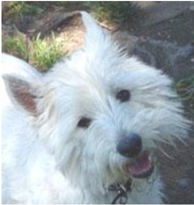
Dash Fostered 33 days

Dash , age 4, came into Rescue because his owner moved into an apartment and Dash was not handling it well. Apparently he needed a yard to play in or an owner who would crate him when not at home. He is a very sweet dog with no socialization issues. He does have some minor allergy issues. He is a tall boy and at 25#, he is at the large end of the size range for Westies. Dash quickly found a new home and is doing well.