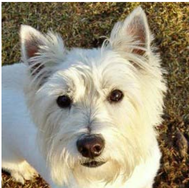
Kadie - Fostered 15 days

Kadie , age 5, came to us when her family got divorced. Mom got Kadie and had to move and live with her daughter who has small kids. Kadie doesn't do well with small children so she was surrendered. Kadie was fostered and adopted by her foster home.