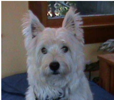
Jack - Placed in 2008