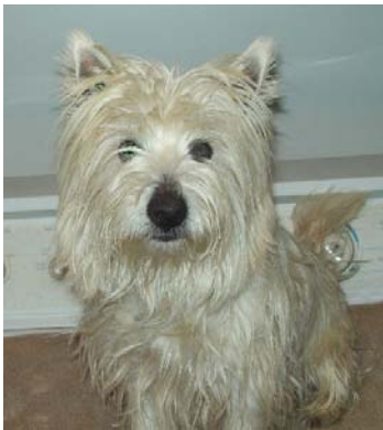
Harry - Euthanized in 2008

Harry , age 1, was a stray at a shelter. He failed their temperament test and they were unable to place him. We took him in hopes that the problem related to the shelter environment and his experiences while a stray. We hoped we would be able to work through his issues. However, while Harry was often very nice, he also had biting issues that made him a dangerous dog, in our opinion. He was put to sleep with many tears from his foster family.