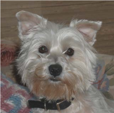
Gidget -Fostered 39 days

Scottie , age 7, came to us because he was marking. His owner did not want to try any longer to correct this issue. When he arrived at his foster home, he had no trouble going outside with the other dogs. He met a man on an outing at the local dog park and it was love at first site. His dad adopted him shortly afterwards. SURRENDER REASON: MARKING