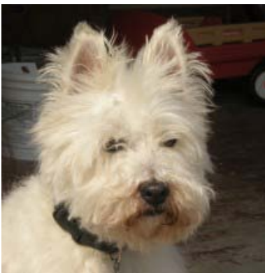
Jay Jay (Fostered 23 days)

Jay Jay , age 12, came into foster care when his mom had a stroke and could no longer care for him. He is a sweet boy. He is a bit hard of hearing. His adopters have room in their heart for an older boy so he now in a happy home along with a Westie "sister", who is also an older Westie.