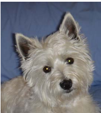
Jazzie - Fostered 66 days

Jazzie , age 3, was not doing well with children. She had been diagnosed with White Shaker disease as a young pup but there is no sign of it now. She is not on any medicines for it at all. Jazzie did have a hard time living with other dogs so she found a new home without any doggie siblings. Jazzie is now a very happy little girl.