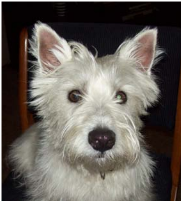
Scrappy (now Wee Mack) Fostered 40 days

Scrappy (now Wee Mack) , est. age 4, was found under a hay wagon in the middle of a very cold winter. It took them 3 days to get him out and into the house. Once there, they cleaned him up but they could not keep him. He was surrendered to us. Wee Mack was a gentleman from the start and did very nicely in foster care. He was adopted and became a brother to Ziggy Stardust (above).