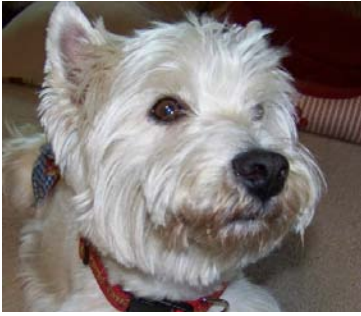
Scottie - Fostered 36 days

Scottie , age 7, came to us because he was marking. His owner did not want to try any longer to correct this issue. When he arrived at his foster home, he had no trouble going outside with the other dogs. He met a man on an outing at the local dog park and it was love at first site. His dad adopted him shortly afterwards. SURRENDER REASON: MARKING