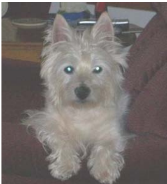
Finley - Fostered 67 days

Gidget , age 6, was "purchased" by her original owner at a pet store. She saw Gidget in a cage off by herself and offered the owner a turtle in exchange for the dog. He made the deal! Gidget's owner has a heart condition and needed surgery. It was going to be several weeks of her own rehabilitation and she felt it would be better for Gidget to find a new home. When Gidget arrived we tried to figure out what else was in her besides Westie. We just aren't sure but she is a mix of some sort. Gidget did well in foster care and is now living in her new home. SURRENDER REASON: OWNER ILLNESS