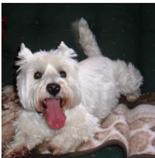
Angus - Fostered 38 days

Finley , age 12, came to us when his owner died. We don't know much of his background but based on his condition, we don't think he was cared for very well. Finley has arthritis in his knees and back legs. He has an injured front leg that may have been broken and not set. He had an untreated ear infection and dental disease that resulted in some extractions. His hearing is "selective" at best. BUT he is a wonderful little boy, full of love and just wants to be loved. When it was time to place him, his foster mom just wasn't able to do so. So Finley has stayed and become a permanent member of her family. SURRENDER REASON: OWNER DEATH