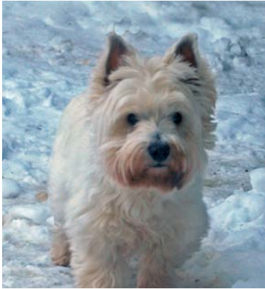
Buttercup - Placed in 2008

Buttercup , age 6, came back into foster care when her mom got very sick and she could no longer care for her. Buttercup came from a breeder who would, of course, take her back but it happened that we were contacted by a potential adopter at just the right moment. This adopter seemed perfect for Buttercup and we were able to arrange the adoption. Buttercup has been very happy with her new, "only dog" status, something she has always wanted to be!