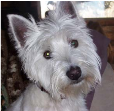
Max (now Willie) Fostered 17 days

Max (now Willie) , age 7 months, was given to the owners as a gift. He was surrendered because they could not housebreak him. (Often when a dog is received as a gift, the owners are not emotionally prepared to make such a life-changing decision. As a result they are more likely to surrender the dog when things don't go exactly as they imagined. Please don't give dogs as gifts!) Max wasn't fostered long before he found his "real" home. He is living nicely with three cats and German Shepherd.